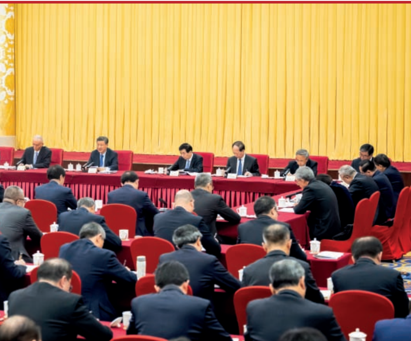
President Xi Jinping, also general secretary of the Communist Party of China (CPC) Central Committee and chairman of the Central Military Commission, visits national political advisors from the Revolutionary Committee of the Chinese Kuomintang, the sector of science and technology, and the sector of environment and resources, who are attending the second session of the 14th National Committee of the Chinese People's Political Consultative Conference (CPPCC) in Beijing, capital of China, March 6, 2024. Xi participated in their joint group meeting, and heard their comments and suggestions. Zhai Jianlan

President Xi Jinping on March 6 called on Chinese political advisors to build broad consensus to contribute to Chinese modernization, while he participated in a joint group meeting during the second session of the 14th National Committee of the Chinese People's Political Consultative Conference (CPPCC).