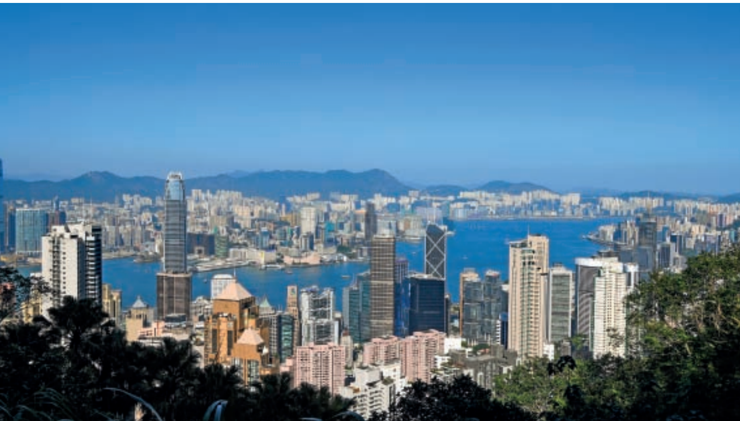
This photo taken on November 18, 2023 shows a panoramic view of the Hong Kong Special Administrative Region, China. Chen Duo