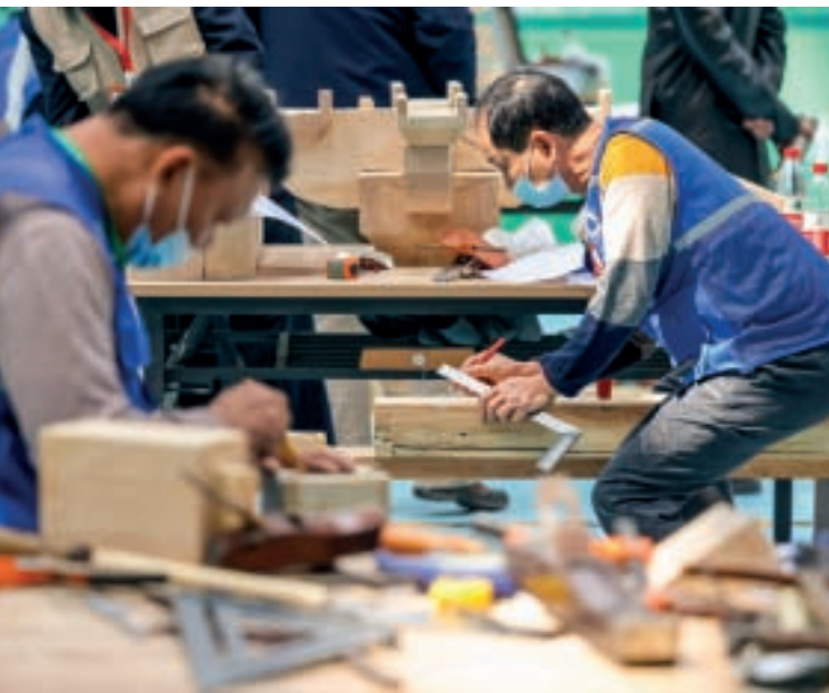
Contestants take part in the competition for wood artifact restoration specialists during the national cultural relics industry vocational skills competition held in Taiyuan, north China's Shanxi Province, on March 25, 2024.