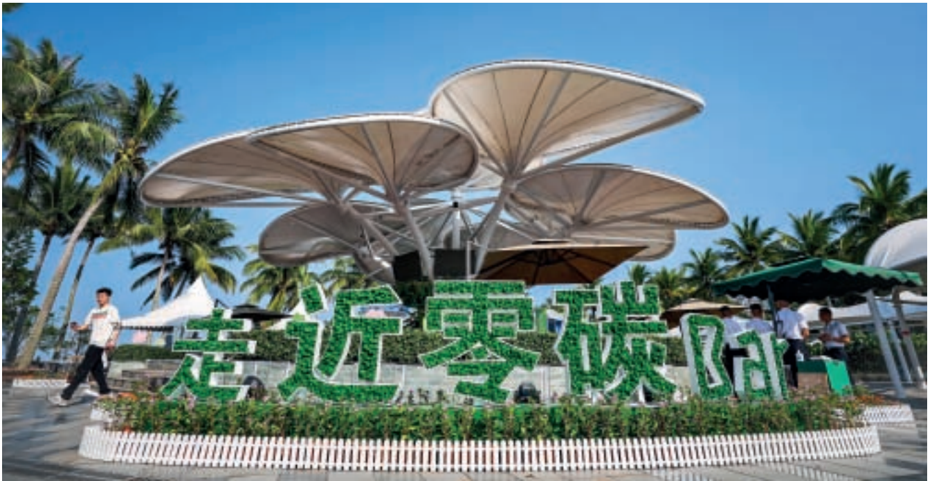
This photo taken on March 22, 2024 shows a rest area in the Boao zero-carbon demonstration zone in Boao, south China's Hainan Province. Zhang Liyun

T op legislator Zhao Leji on March 28 called for solidarity and cooperation to meet challenges and work together to create a better future for Asia and the world.