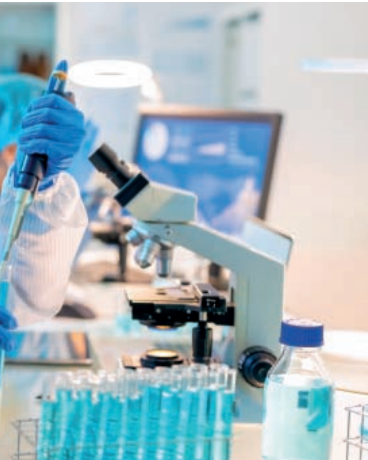
An asian scientist holds a test tube.

primary and middle schools, and other education institutes, as well as temporary settlements for residents affected by a powerful earthquake in December.