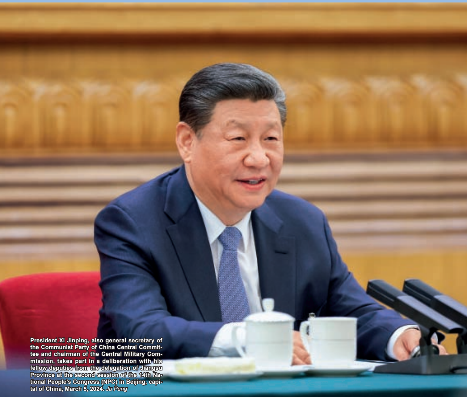
President Xi Jinping, also general secretary of the Communist Party of China Central Committee and chairman of the Central Military Commission, takes part in a deliberation with his fellow deputies from the delegation of Jiangsu Province at the second session of the 14th National People's Congress (NPC) in Beijing, capital of China, March 5, 2024. Ju Peng