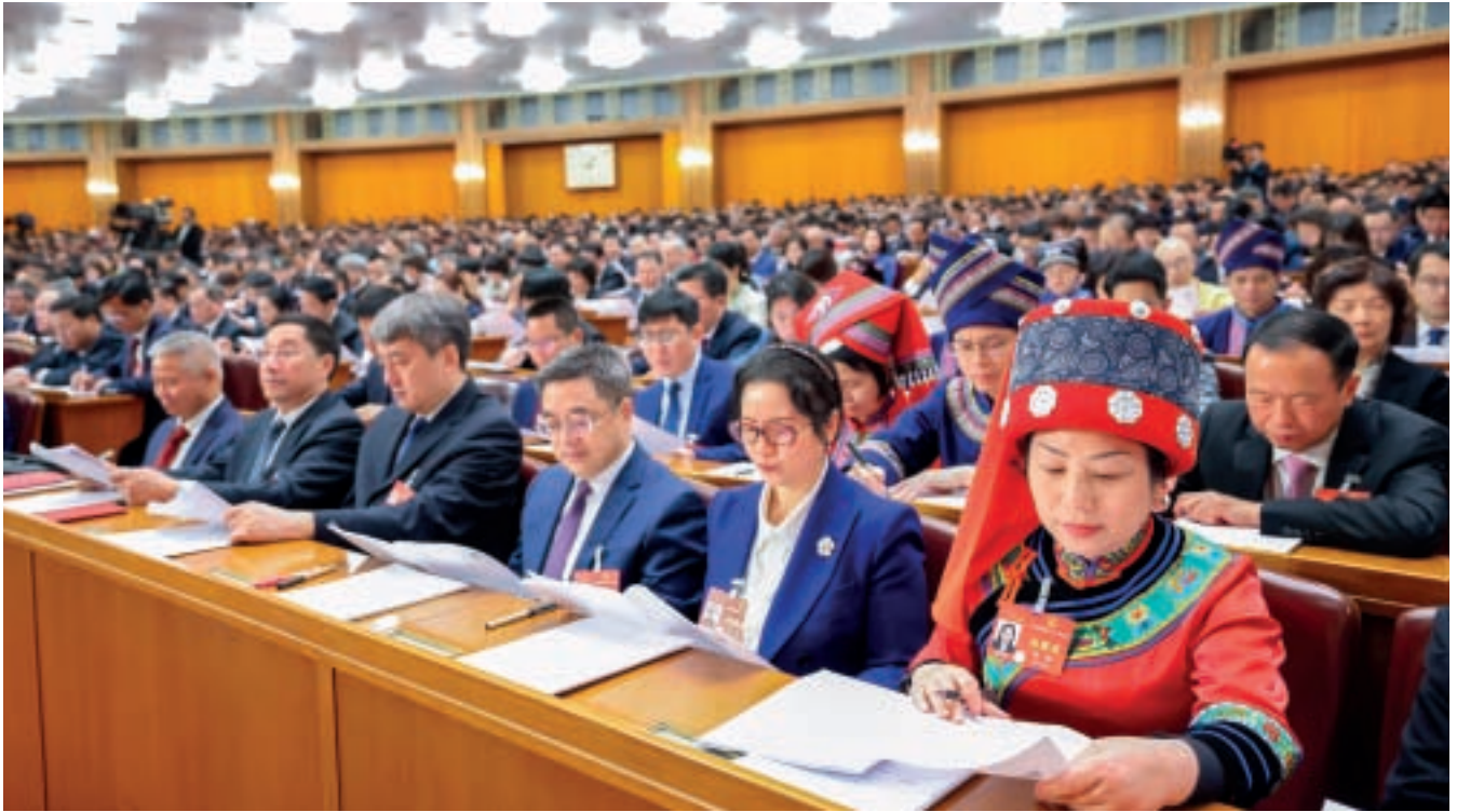
Deputies to the National People's Congress (NPC) attend the second plenary meeting of the second session of the 14th NPC at the Great Hall of the People in Beijing, capital of China, on March 8, 2024. Liu Weibin

S tressing the importance of developing whole-process people's democracy, Zhao Leji, chairman of the Standing Committee of the National People's Congress (NPC), called on national lawmakers to unite and gather strength to continuously promote Chinese modernization and realize people's aspirations for a better life.