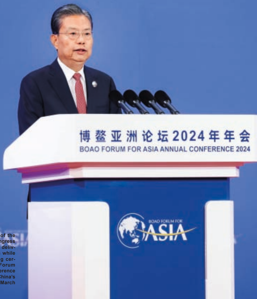
Zhao Leji, chairman of the National People's Congress Standing Committee, delivers a keynote speech while attending the opening ceremony of the Boao Forum for Asia Annual Conference 2024 in Boao, south China's Hainan Province, on March 28, 2024. Pang Xinglei