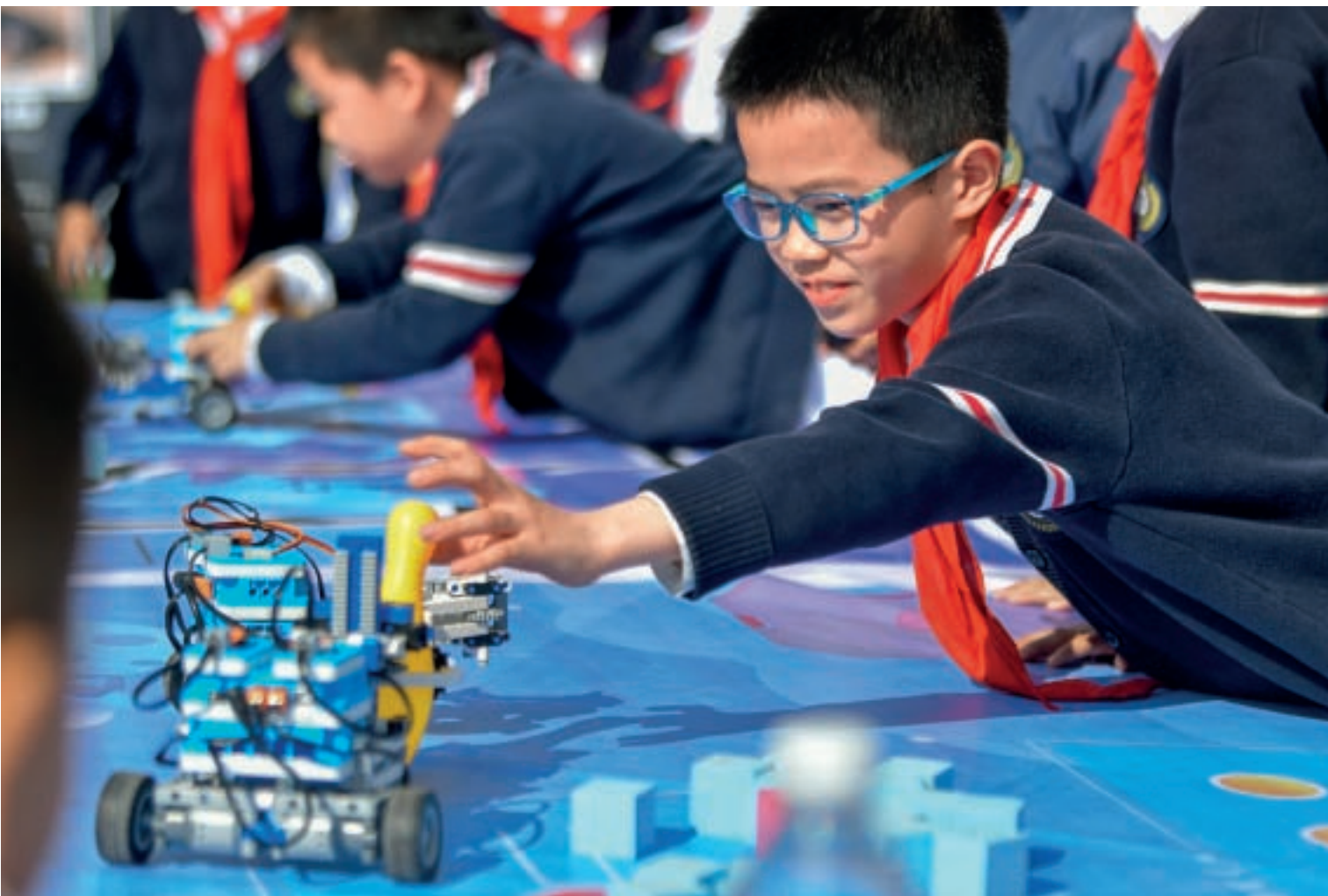
Students of the 76th elementary school in Urumqi, capital city of northwest China's Xinjiang Uyghur Autonomous Region, engage in activities at a science popularization event, on March 26, 2024. Wang Fei