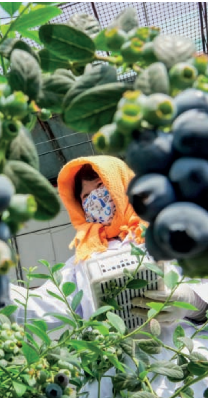
Members of a blueberry planting cooperative in Liutiangezhuang Town, Lulong County, north China's Hebei Province, harvest organic blueberries in the greenhouse, on March 25, 2024.

making more than 10,000 yuan (1,389 U.S. dollars) per year.