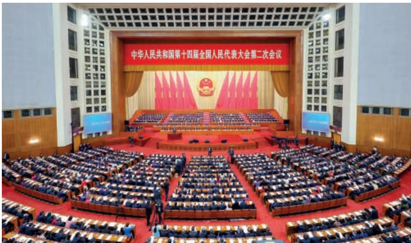
The opening meeting of the second session of the 14th National People's Congress is held at the Great Hall of the People in Beijing, capital of China, on March 5, 2024. Ding Haitao

During the deliberation on March 5, Xi said that it is imperative for Jiangsu to fully integrate into and contribute to the development of the Yangtze Economic Belt and the strategy for integrated development of the Yangtze River Delta, urging the major economically developed province to better leverage its strength to drive the development of the whole region and the whole country. (Xinhua) ■