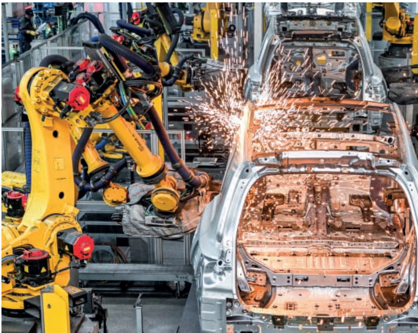
Robots weld bodysells of cars at a workshop of Chinese electric vehicle (EV) maker Li Auto Inc. in Changzhou, east China's Jiangsu Province, January 10, 2024.

Meanwhile, the country will address both the symptoms and root causes to defuse risks in real estate, local government debt and small and medium-sized financial institutions to safeguard overall economic and financial stability, the report said.