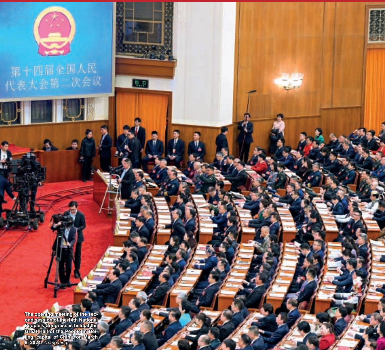
The opening meeting of the second session of the 14th National People's Congress is held at the Great Hall of the People in Beijing, capital of China, on March 5, 2024. Zhang Ling