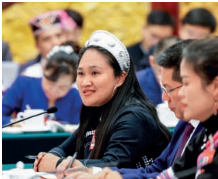
Li Ruifang, a deputy to the National People's Congress (NPC), speaks at the plenary meeting of the Yunnan delegation during the second session of the 14th NPC, on March 5, 2024. Liu Weibing

"It is the duty of us deputies to always bear the people in mind, talk with them and solve problems for them in our capacity," Ning said. (Xinhua) ■