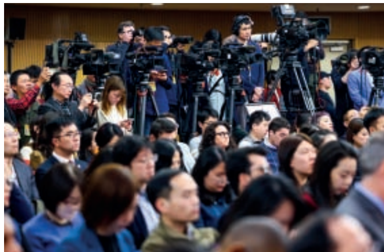
Foreign Minister Wang Yi attends a press conference on China's foreign policy and foreign relations on the sidelines of the second session of the 14th National People's Congress in Beijing, capital of China, March 7, 2024. This photo shows the scene at the press conference. Liu Xu

"Spreading pessimistic views on China will end up harming oneself, and misjudging China will result in missed opportunities," Wang said. (Xinhua) ■