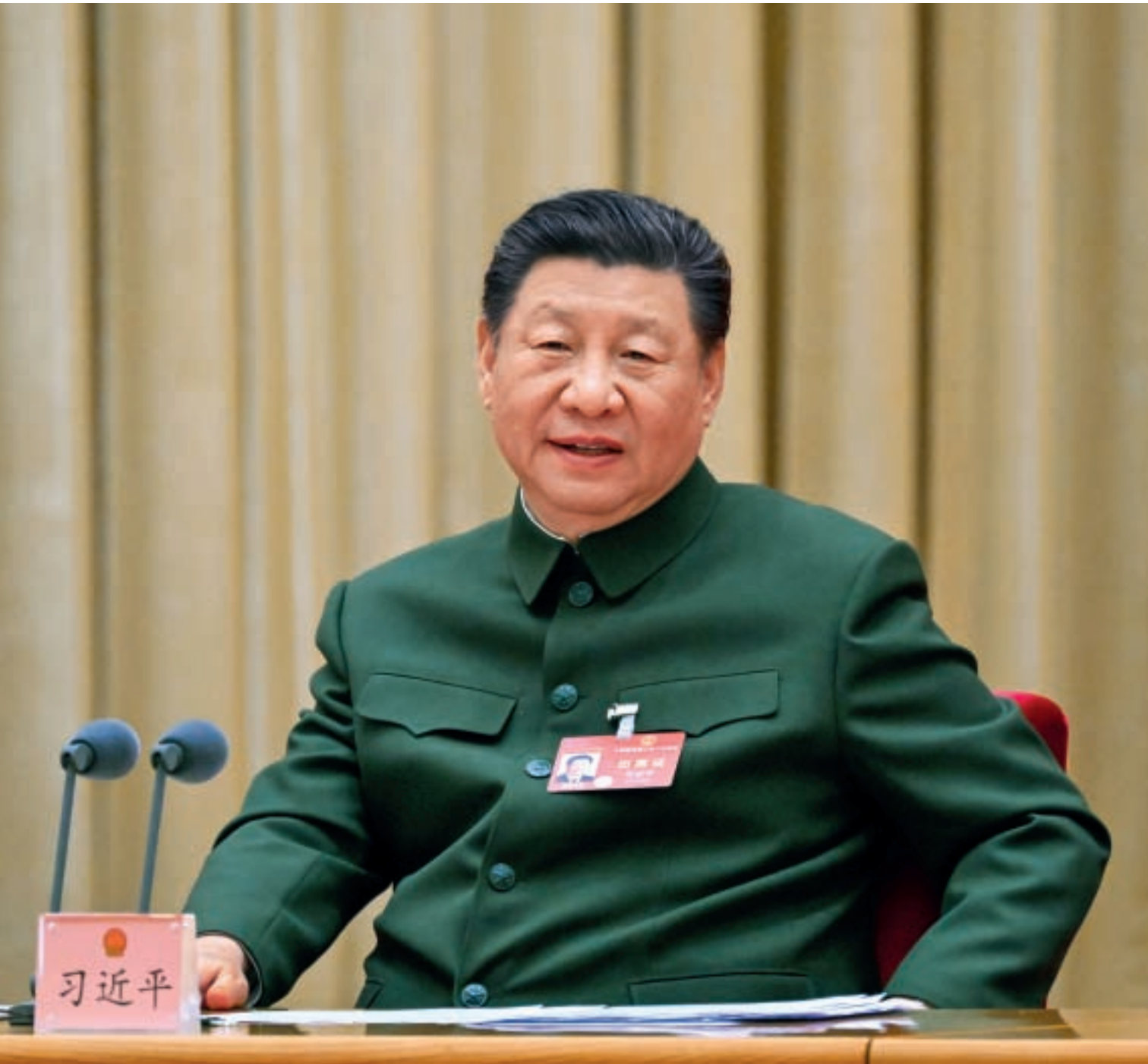
President Xi Jinping, also general secretary of the Communist Party of China Central Committee and chairman of the Central Military Commission, attends a plenary meeting of the delegation of the People's Liberation Army (PLA) and the People's Armed Police Force at the second session of the 14th National People's Congress (NPC) in Beijing, capital of China, March 7, 2024. Xi delivered an important speech at the meeting. Li Gang

Xi noted that it is necessary to step up independent and original innovation, in order to foster growth drivers for new quality productive forces and new quality combat capabilities.