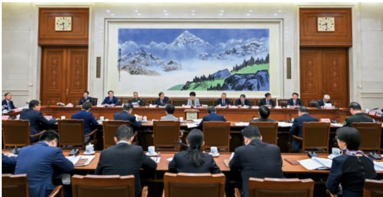
The Constitution and Law Committee of the 14th National People's Congress convenes a plenary session to review the draft revision of the Organic Law of the State Council based on suggestions raised during deliberations of delegations on March 7, 2024. Mu Yu

The revision of this significant and longstanding law is a response to the evolving demands of the times and aligns better with the functions of the current State Council, Zhuang emphasized. “It is a result of our practice over the past few decades, and responds to the practical needs of the operation of the State Council,” he remarked. Zhuang further noted that the true impact of the revision will become more apparent after a few years of implementation. ■