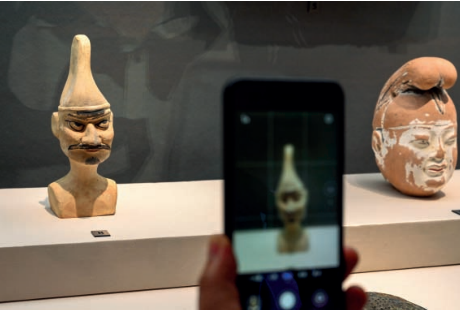
Painted clay figurines are showcased at the exhibition of fine historical relics from Xinjiang Uyghur Autonomous Region at the National Museum of China, on June 16, 2023. Jin Liangkuai