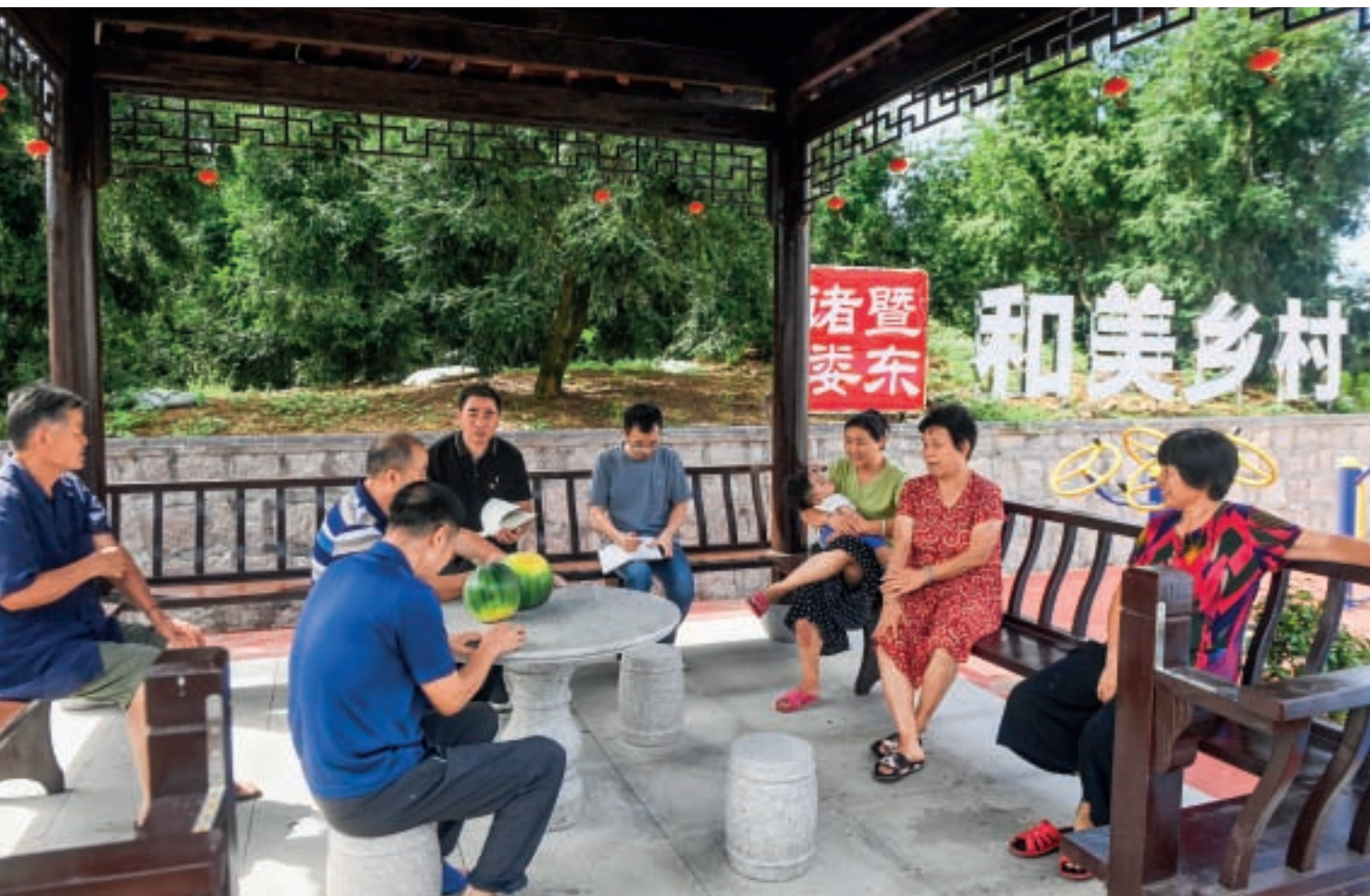
Officials of Dongbaihu Town as well as officials and villagers of Loudong Village in Zhuji City, east China's Zhejiang Province, hold a democratic discussion to exchange views on livelihood projects and solicit opinions and suggestions from the villagers, on July 26, 2023. Xu Yu

Ning has registered a cooperative specializing in large-scale planting, creating about 200 jobs for villagers. At this year's NPC session, she submitted a suggestion on allowing agricultural insurance to cover greenhouses in southern China.