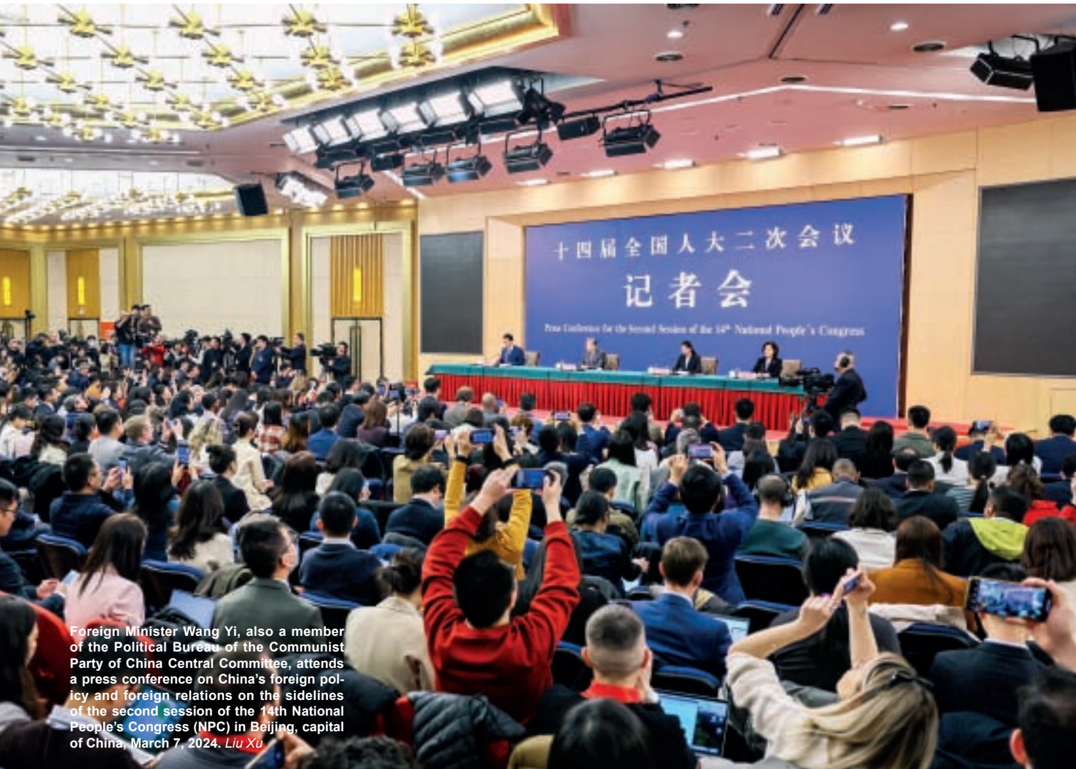
Foreign Minister Wang Yi, also a member of the Political Bureau of the Communist Party of China Central Committee, attends a press conference on China's foreign policy and foreign relations on the sidelines of the second session of the 14th National People's Congress (NPC) in Beijing, capital of China, March 7, 2024. Liu Xu