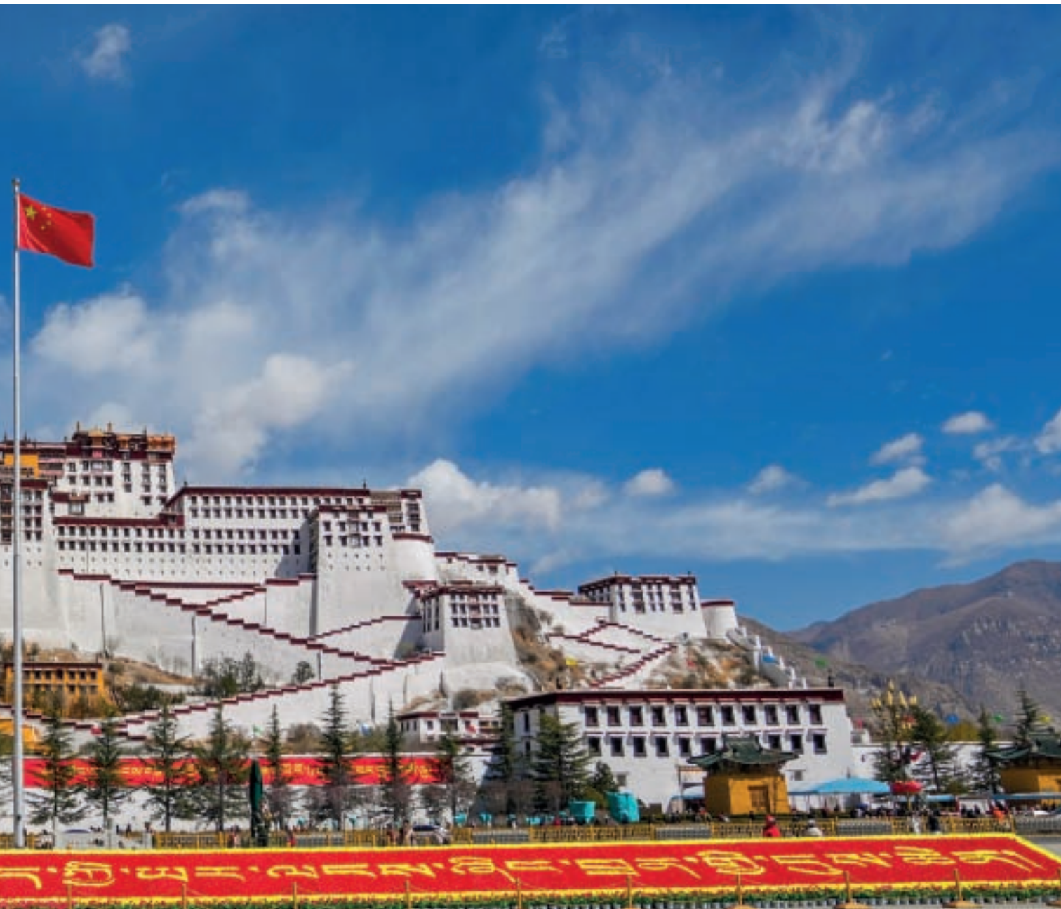
The national flag of China is seen on the square in front of the Potala Palace on the Serfs' Emancipation Day in Lhasa, capital of southwest China's Xizang Autonomous Region, on March 28, 2024. Jigme Dorje

in Qonggyai county in the city of Shannan.