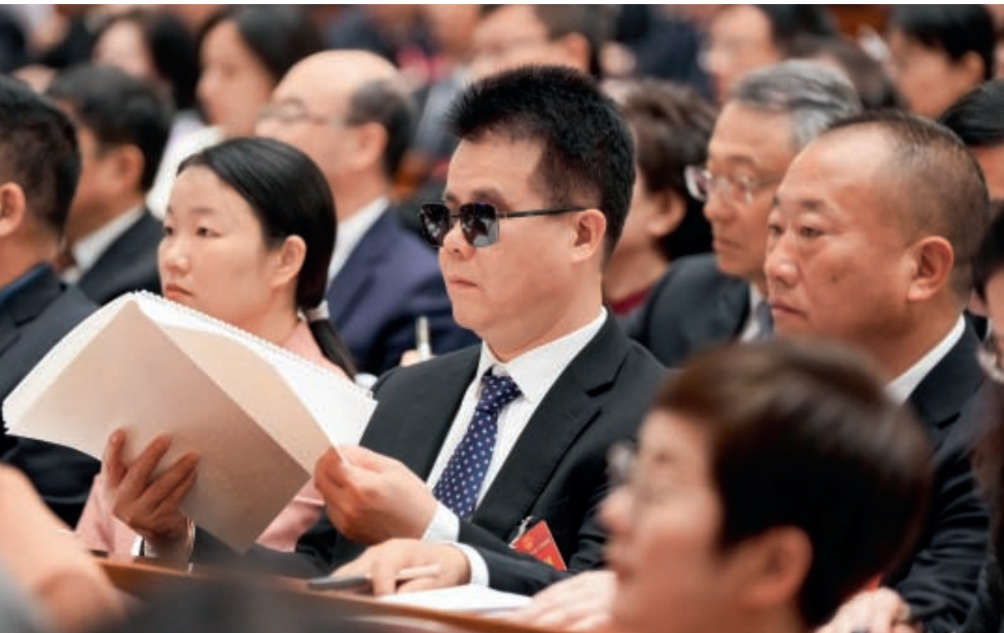
Wang Yongcheng, a deputy to the National People's Congress (NPC), reads the government work report in Braille while attending the opening meeting of the second session of the 14th NPC at the Great Hall of the People in Beijing, capital of China, on March 5, 2024. Wang Yuguo

"Whole-process people's democracy is the defining feature of socialist democracy," Xi said. "It is democracy in its broadest, most genuine and most effective form."